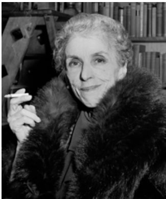
KAREN BLIXEN, 1959.

WAS KAREN BLIXEN, THE DANISH NATIONAL ICON, A RACIST WHO FLIRTED WITH NAZISM? A NEW BOOK HAS PROVIDED NEW FUEL IN THE DEBATE ON BLIXEN.