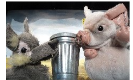
The True Tale of the 3 Little Pigs

For more information please contact lisbeth@refleksion.dk