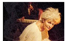
Hansel and Gretel

Watch a video teaser here: http://vimeo.com/17915652