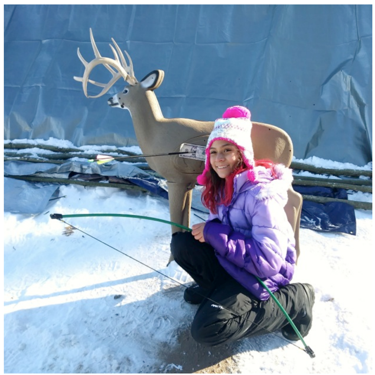
Figure 3: A 5th grade student before she claims her prize (2018).