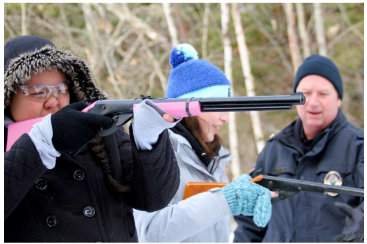
Figure 11: 8th graders shooting BB guns with tribal police (2018).

In 2016, our team presented a poster on our collaborative projects at a conference in an attempt to promote the positive effect cultural revitalization can have on a community's health and wellbeing. After explaining the project to one individual, we were asked "what we actually did." The question flummoxed us. This particular person was not impressed with the amount of shoveling we did, nor with the difficulties of trying to teach archery to a 10-year old who has never shot a bow before. We believe the importance of our work lies in radical humility—knowing full well that we run the risk of sounding anything but humble. Radical humility requires that we always understand that this experience is not about us, that we recognize that there is always more work to be done to be better collaborators, and that our greatest value in these efforts sometimes lies in picking up a shovel to help facilitate what Jeff Corntassel calls "everyday acts of resurgence" (Corntassel 2012, 88). "What we actually do" is show up, help where we can, and be attentive, humble, and respectful. In the words of Carol Amour, what we do signals to the youth that "we are all teachers and all learners here" (Cederström, DuBois, and Frandy 2016), and that education is about creating knowledge and meaning together, not listening to the person with the most degrees.