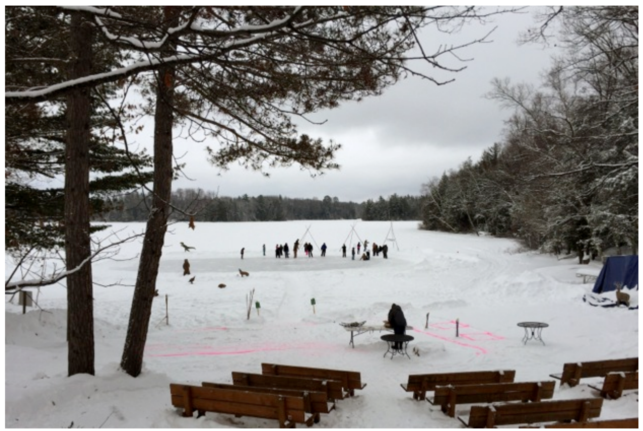
Figure 1: The Ojibwe Winter Games set-up at YMCA Camp Nawakwa (2016).

Last year, we had to move the games off the lake. It was too warm that February, with highs in northern Wisconsin pushing into the 60s—a far cry from the -30 temperatures we had seen only two years before. The ice was slowly melting. Holes made for spearing muskie were flooding our hoop-and-spear game area. Oak leaves, catching the sun's intense heat, melted into and even through 18 inches of ice. With scores of elementary school students on their way, we couldn't take the risk. Two days later, we had to cancel the games because of a snowstorm.