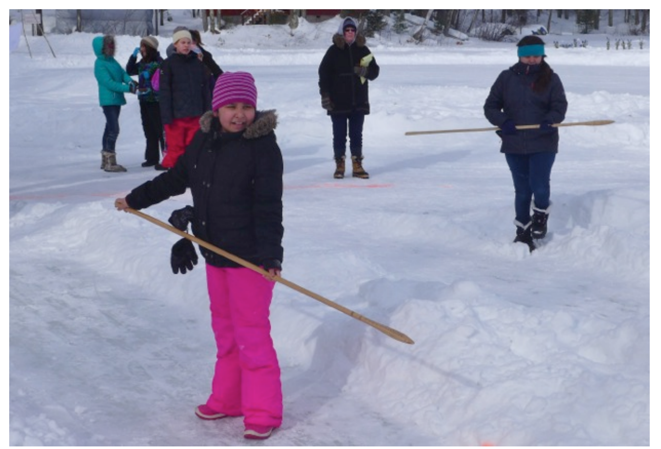
Figure 4: Preparing to throw a snowsnake (6th graders, 2015).