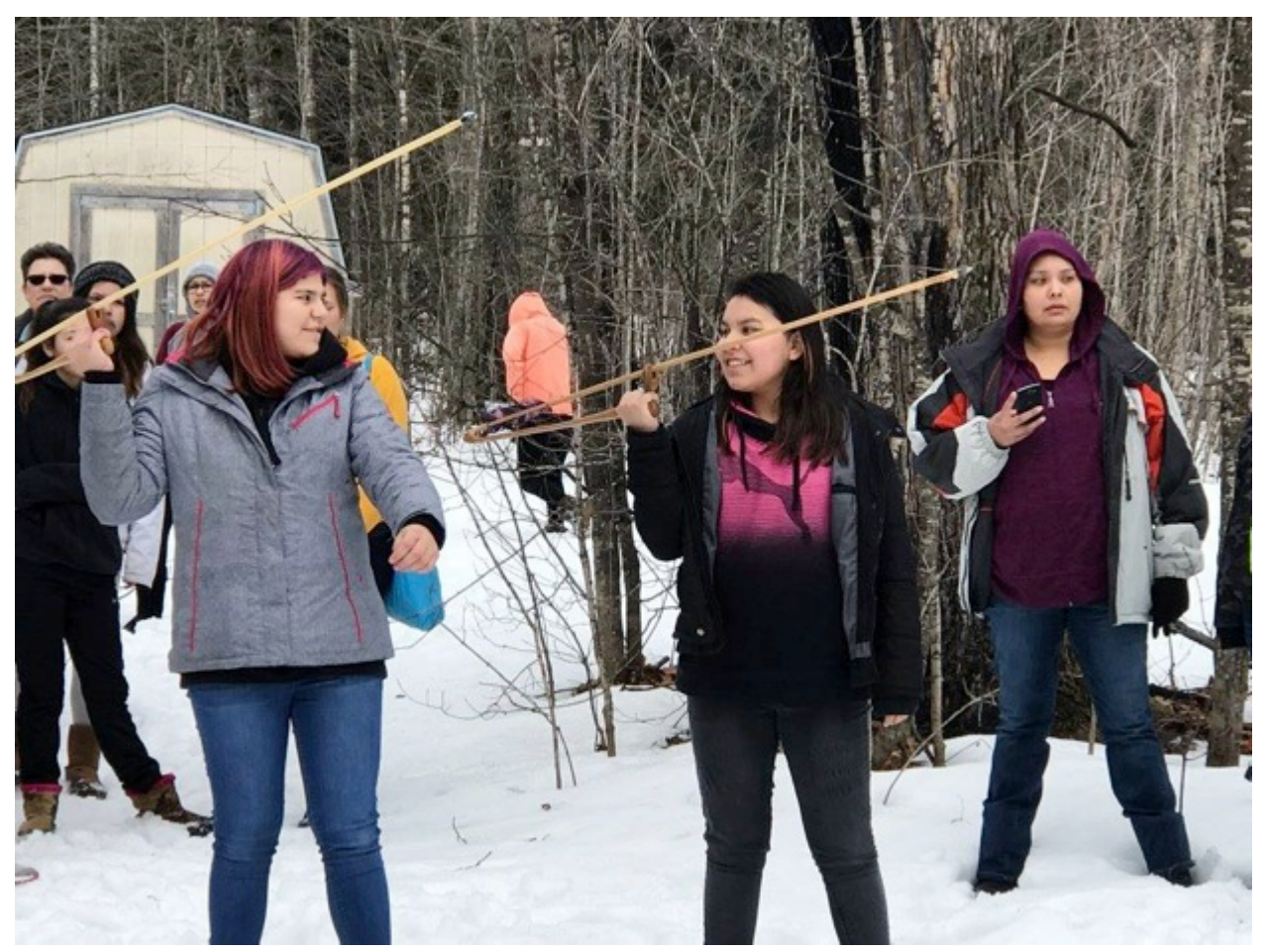
Figure 5: Preparing to throw with an apaaginaatig (7th graders, 2017).

Each day of the Games a new grade comes out, sixth, seventh, and eighth, with students running through a similar routine, competing for medals. On Friday, fourth graders from Lac du Flambeau join fourth graders from other area grade schools to spend their first year at the Winter Games. While Lac du Flambeau public school is 98% Native American, other area schools are predominantly white. For white students, the games are a point of access to better learn about their Anishinaabe neighbors. Because the number of students on this day can reach upwards of 200, students rotate through all the stations at once, and the games are for practice and fun rather than competition. The Lac du Flambeau students return every year, and with the Games now entering their seventh year, several cohorts have grown up with the event. The longer the Games have run, the more positivity and excitement students have brought to them.