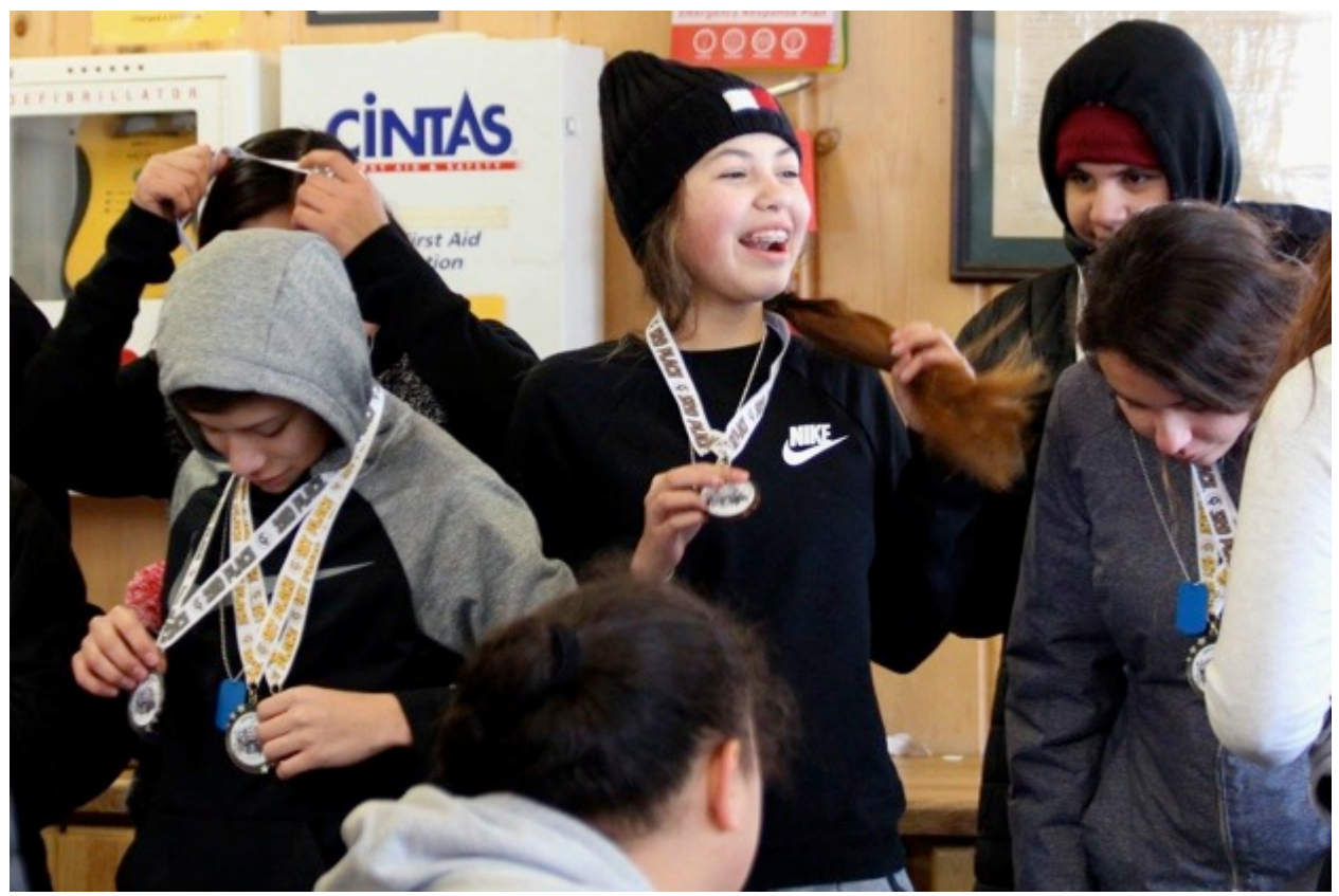
Figure 10: 8th grade award winners (2018).

improving self-esteem have on populations dealing with historical trauma. Creating and sustaining positive self-identity has, according to teachers at Lac du Flambeau, helped students succeed in the classroom. And outside of the classroom, the Games encourage students to view Lac du Flambeau and their wider community as a place worth returning to as adults, a place to build a career and raise a family, and a place with a culture and knowledge that are valuable and worth sustaining. The Ojibwe Winter Games are not just about teaching sustainability, but practicing it.