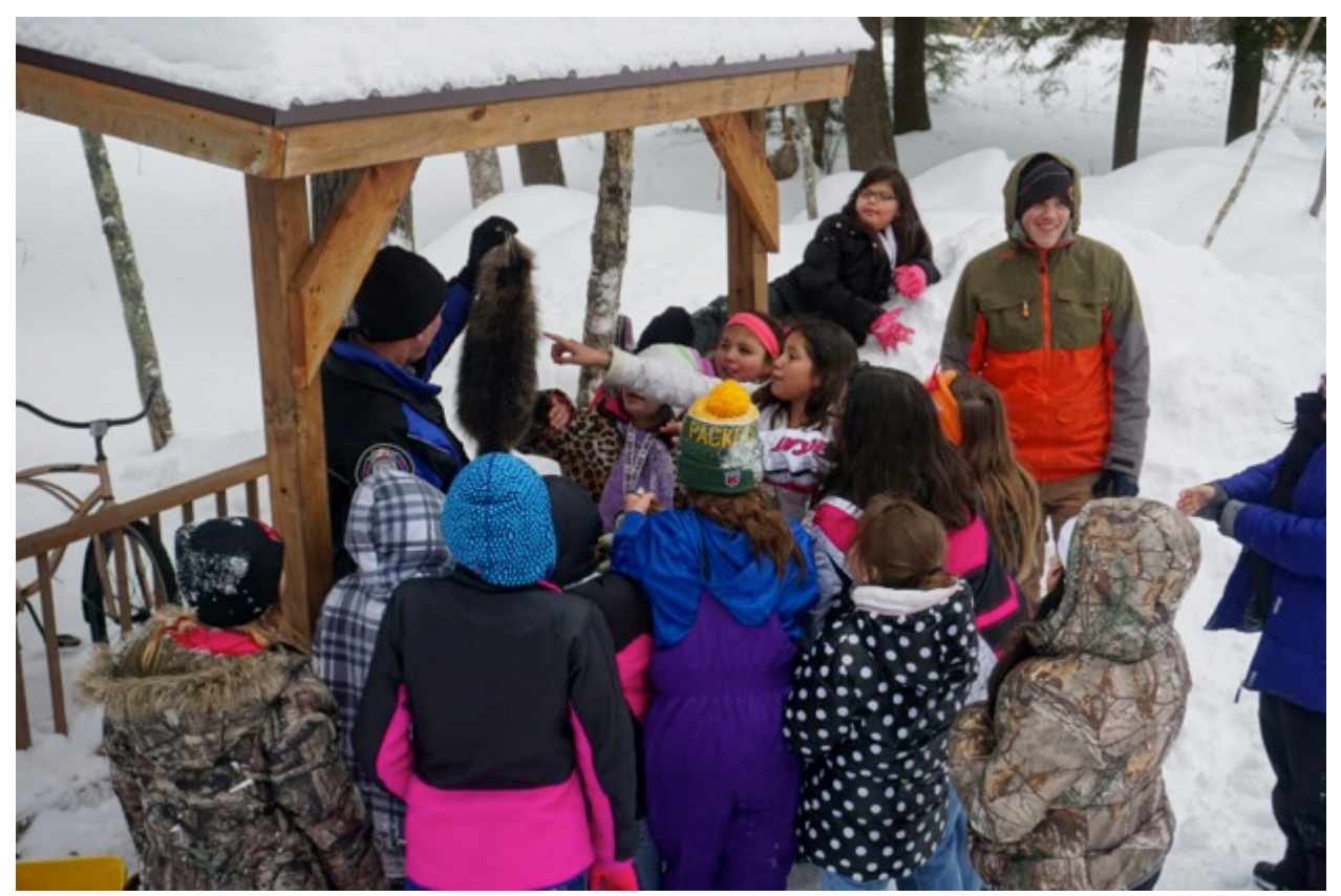
Figure 6: The Wisconsin DNR demonstrates trapping techniques (5th graders, 2016).

universal and correct. This presumed universality (or superiority) of Western cultural norms is entangled and complicit with broader ethnocentric rationalizations of colonization. Indigenous learning environments tend to be less hierarchical, more focused on relationality, more hands-on, more integrative of cultural teachings, more local in concern, and more intergenerational than Western learning environments. Valliere's classroom, for instance, is oriented in a circle, which he teaches in the middle of, because "that's how knowledge flows, that's how creation flows, in a circle" (Cederström et al. 2015).