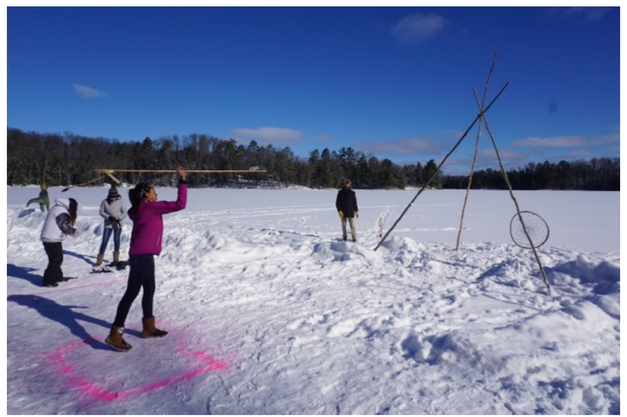
Figure 7: Competing in the hoop and spear game (6th graders, 2016).

language, are all part of the curriculum that Valliere uses to teach culturally. These crafts encourage students to think creatively about plants and animal and to see their environment in traditional ways that value resourceful and adaptive use of natural materials. As Valliere says, "We use things like the birchbark canoe building and use the Ojibwe Winter Games to reinforce Ojibwe words so they learn their language and, at the same time, their identity" (Valliere 2014).